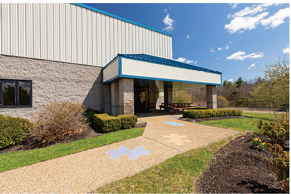
1 Puzzle Lane, Newton, NH

And while the group has purchased a number of fully-leased, stabilized assets, including the aforementioned 112 Barnum Road, 10-20 Dan Road in Canton ($34 million) and 3 Technology Dr. in Centennial Park in Peabody (in a $30 million all-cash deal), it is Seyon's ability to uncover deals that has spurred their continued success in this hyper-competitive market. Two 2021 acquisitions exemplify the type of diligence that Seyon has employed in pursuing assets. In August, Seyon acquired 1 Puzzle Lane, a vacant 100,000 square foot Class A warehouse with 30' ceiling heights located on the Massachusetts/New Hampshire border for $9.25 million. The deal was brought to them by broker John Meador, who had previously worked at Seyon in 2017. In May, the firm purchased 65 Green Street in Foxborough, a 50,000 square foot light