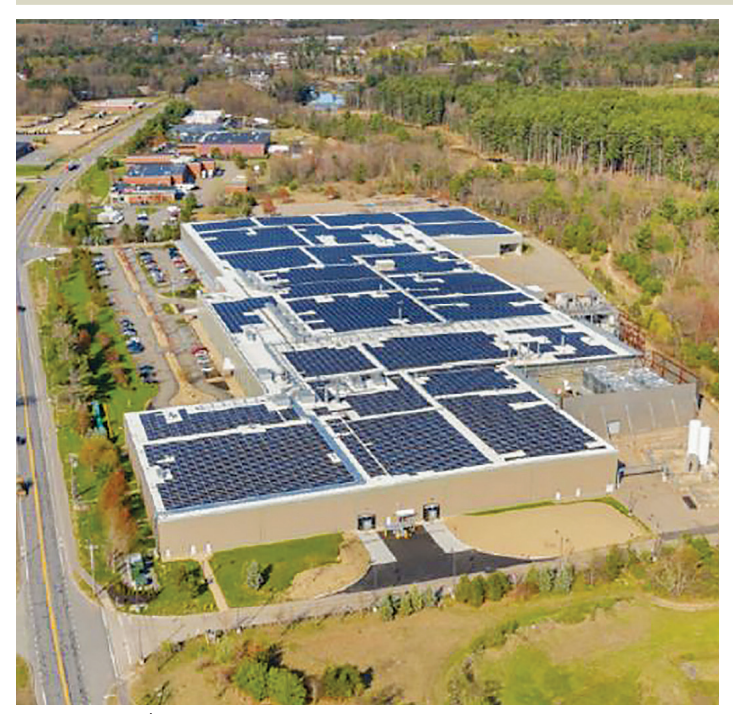
112 Barnum Rd., Devens MA